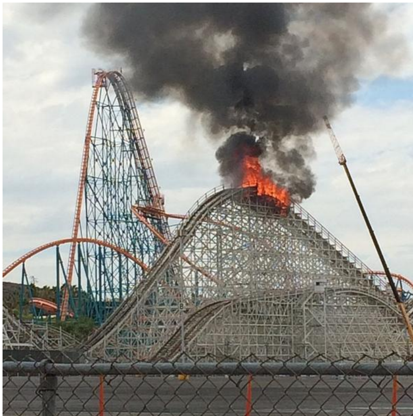
In 2014, a thirty-six-year-old wooden roller coaster in Valencia, California dramatically caught fire and partially collapsed.