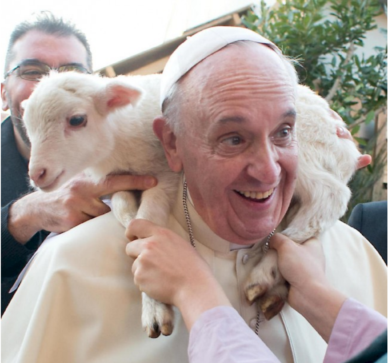
Pope Francis snuggles a baby lamb at the living nativity scene at a church outside Rome on January 6, 2014. The Huffington Post , January 7, 2014.